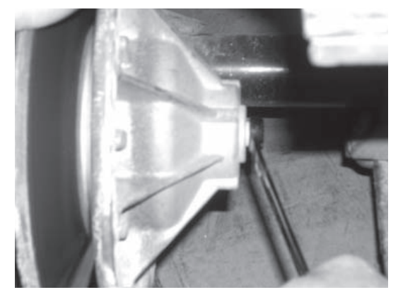
B. Clutch Removal

1) Install the spring and cup in place and using the pressing tool (white PVC cap) press the spring and cup down far enough to install the snap ring. See picture (C). A press works well for this and or some muscle utilizing a section of 2x4 wood pressing down for leverage. Secure the snap ring with the 90 degree snap ring pliers and make sure it seats all the way.